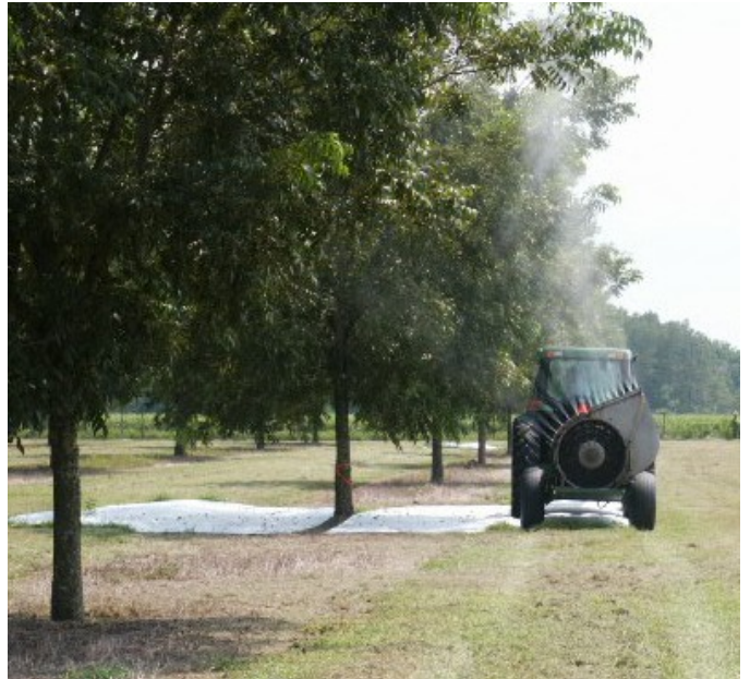
Air-blast type pecan tree sprayer

the spring, and it is unusual, although not unthinkable for the flower crop to be damaged by