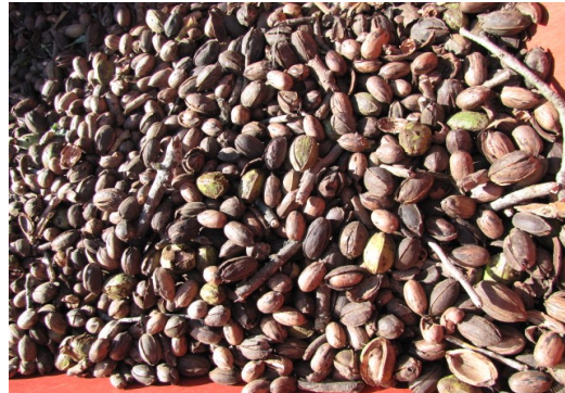
Machine-harvested pecans and trash before processing