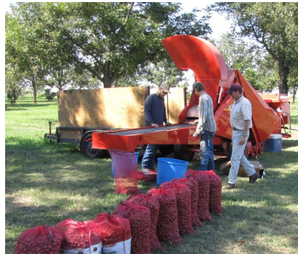
Pecan cleaner and sacking operation