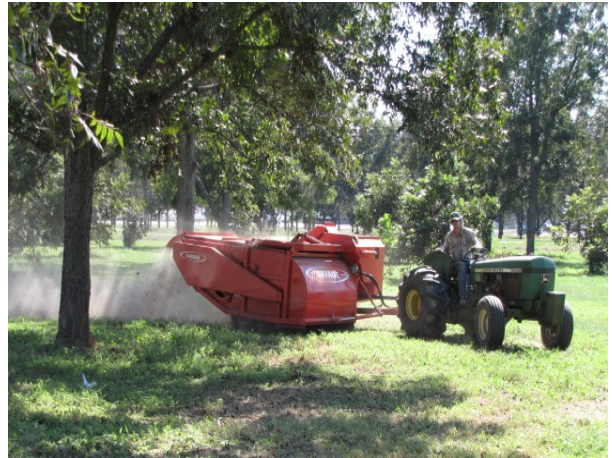
PTO—powered pecan harvester

to prevent kernel darkening, embryo rot, vivipary (sprouting), mycotoxins such as aflatoxin, and other problems related to moist pecans. Shucks not removed in the orchard by nature or the harvesting equipment are removed with dehulling equipment. In south Texas, where harvest is begun before the shucks are fully open to prevent vivipary, the shucks must be ground off in water with special equipment. Once de-shucked, poorly filled pecans are vacuum sepa-