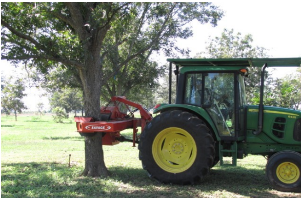
PTO –powered trunk shaker

Processing pecans immediately after harvest is needed to obtain a good early season price and