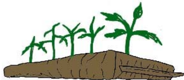
A "tube" or bag garden is an easy method to grow vegetables.

Proper watering is essential for a successful container garden. Generally one watering per day is adequate. However, poor drainage will slowly kill the plants. The mix will become water-logged and plants will die from lack of oxygen. If at all possible, avoid wetting the foliage of plants since wet leaves will encourage plant diseases. Always remember that each watering should be done with the nutrient solution except for the weekly leaching with tap water.