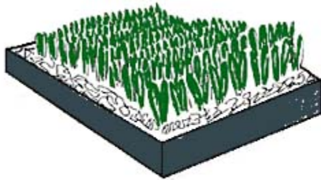
Green onions, radishes or beets can be grown in a cake pan.

easy to handle and provide adequate space for root growth.