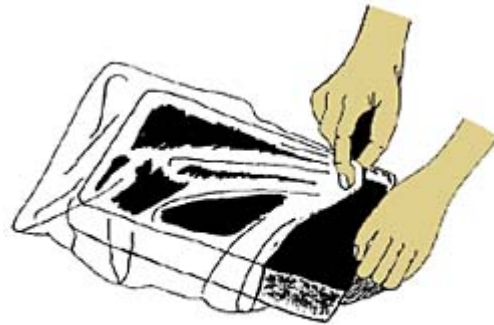
Covering the seed flat with a clear plastic bag will hasten germination.

Best suited for container culture are vegetables which may be easily transplanted. Transplants may be purchased from local nurseries or can be grown at home. Seeds can also be germinated in a baking pan, plastic tray, pot or even a cardboard milk carton. Fill the container with a good media such as the one previously described, and cover most vegetable seed to a depth of 1/4 inch to 1/2 inch to insure good germination. Another method would be to use peat pellets or peat pots which are available from local nursery supply centers.