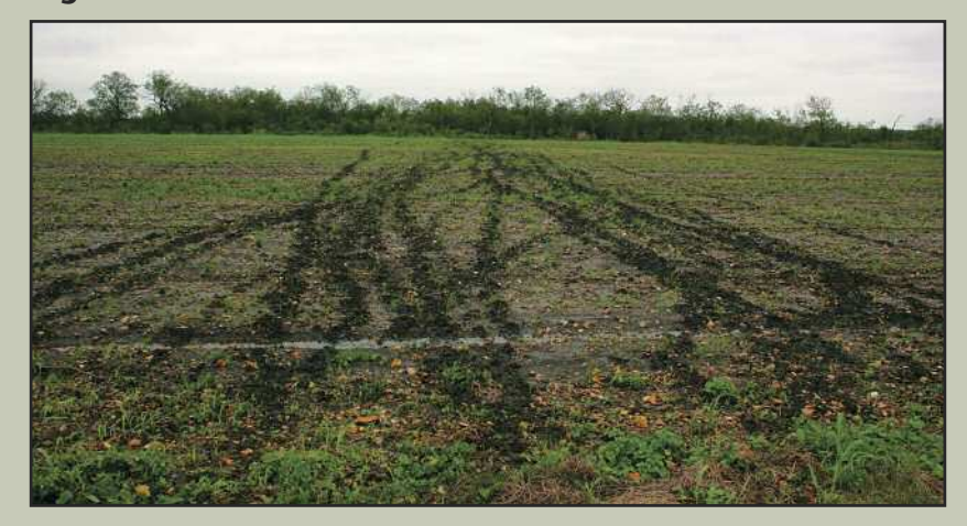
Feral hogs traveled across this field from cover to a feeding area. Fence lines where these trails converge are excellent locations for large traps.

you place the trap where there is ongoing damage by hogs, the bait will compete with a food source that the hogs are already using, and hogs tend to prefer a familiar food source.