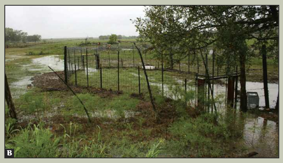
A well-traveled feral hog trail passes under a fence between two properties (A). Here, a large corral trap is an effective option (B). This trap is set along a known feral hog trail and is equipped with saloon-type doors on both ends.

locations still exist. Feral hogs often travel along creeks and roads and use cover near overgrown fence lines while traveling. These areas funnel feral hog travel and provide excellent places to set corral traps, particularly if they lead to a feeding area.