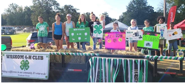
Waskom 4-H Club Howdeo Float in parade

JUNIOR MISS HOWDEO - WESTERN WEAR - PHOTOGENIC - ALL AROUND