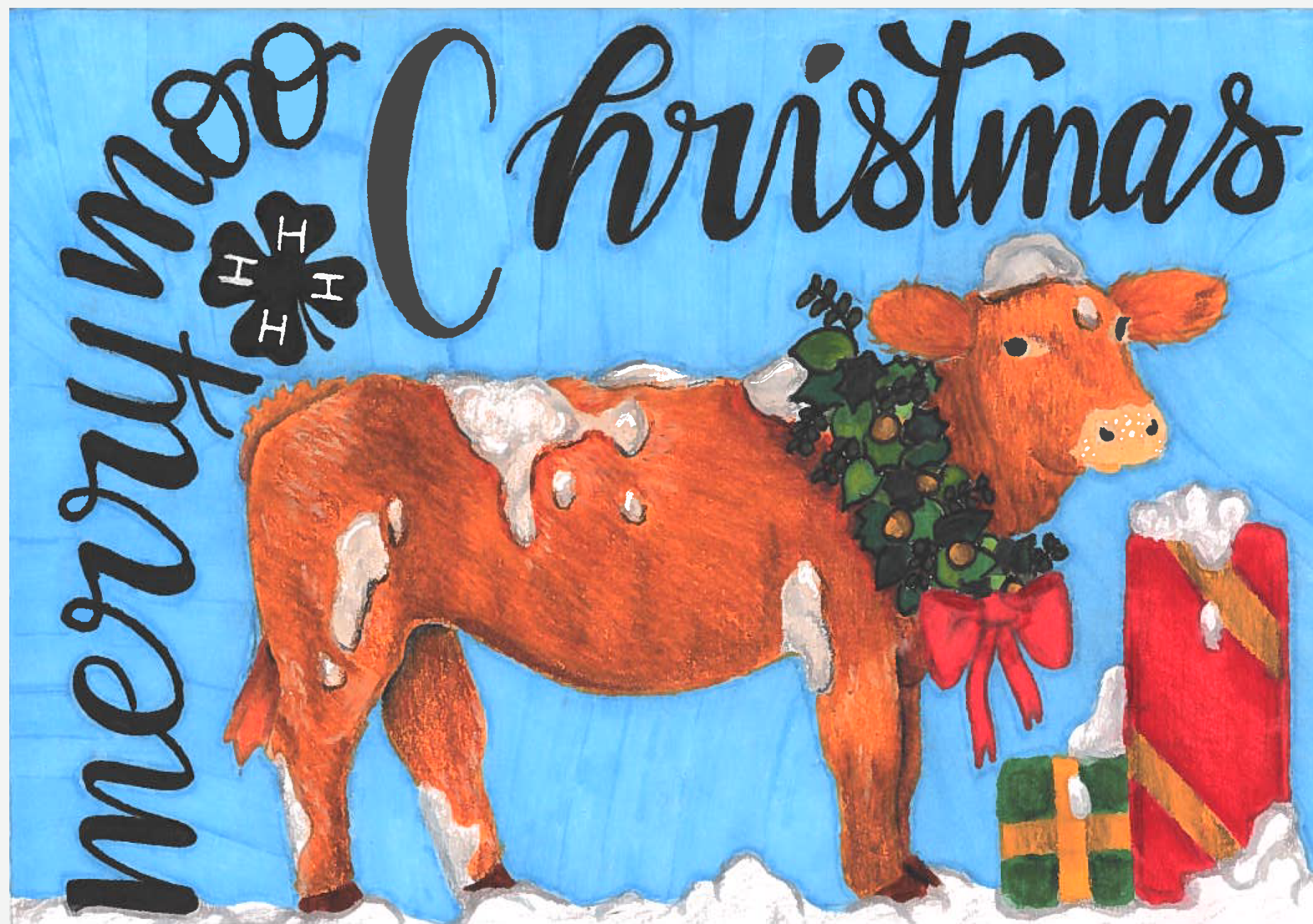
2021 Texas 4-H Christmas Card Finalist

102 W. HOUSTON MARSHALL, TX 75670 903-935-8413